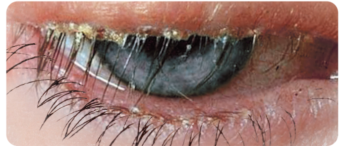
Sore, red, inflamed eyelids; crusty eyelashes

Sometimes, people will experience both types of Blepharitis because the causes are often connected.